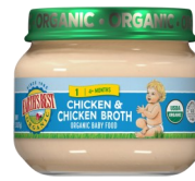
Chicken & Broth

For exclusively breastfeeding participants only; Earth's Best Organic brand; 2.5 ounce glass jars only; Only the specific types as listed: