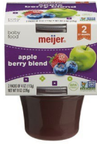
Apple Berry Mix