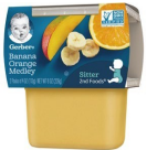
Banana Orange Medley