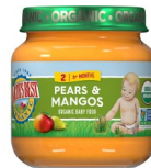
Pears & Mangos