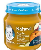
Apple Zucchini Peach