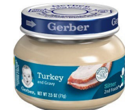
Turkey & Gravy