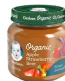
Apple, Strawberry & Beet