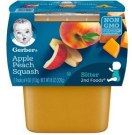
Apple Peach Squash