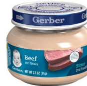
Beef and Gravy

For exclusively breastfeeding participants only; Gerber brand second foods only; 2.5 ounce glass jars only; Only the specific types as listed: