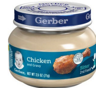
Chicken and Gravy