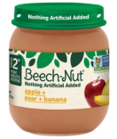
Apple Pear Banana