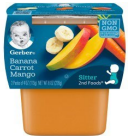
Banana Carrot Mango