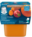
Sweet Potato Apple Pumpkin