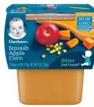
Squash Apple Corn