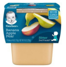
Banana Apple Pear