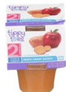
Apple Sweet Potato