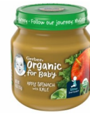
Spinach with Kale