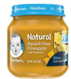
Squash Pear Pineapple