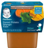
Sweet Potato Mango Kale