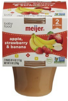
Apple Strawberry Banana

Meijer brand foods only; 2-4 ounces plastic twin-pack; Only the specific types as listed: