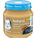
Apple Strawberry Banana