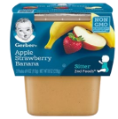
Apple Strawberry Banana