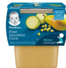
Pear Zucchini Corn