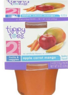
Apple Carrot Mango