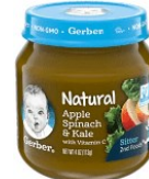
Apple Spinach Kale