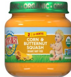
Corn & Butternut Squash