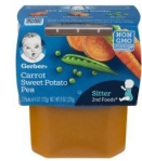
Carrot Sweet Potato Pea