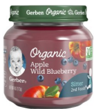
Apple Wild Blueberry