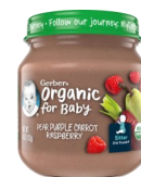
Pear, Purple Carrot & Raspberry