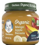
Mango Apple Banana