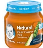
Pea Carrot Pea