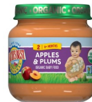
Apples & Plums