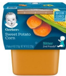
Sweet Potato Corn