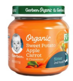
Sweet Potato Apple, Carrot & Cinnamon