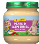
Pears & Raspberries