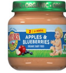
Apples & Blueberries