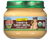
Turkey & Broth