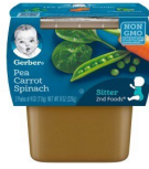
Pea Carrot Spinach