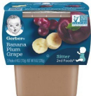
Banana Plum Grape