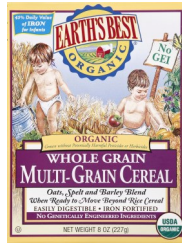
Whole Grain Multi-Grain