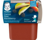
Carrot Pear Blackberry