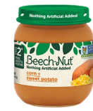
Corn and Sweet Potatoes