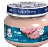
Ham and Gravy