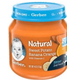
Sweet Potato Banana Orange